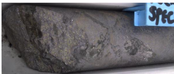
Visible galena (silvery-grey) and chalcopyrite (yellowish) in drillcore from Bungalow-Minbrie BUDD192, 157.2m